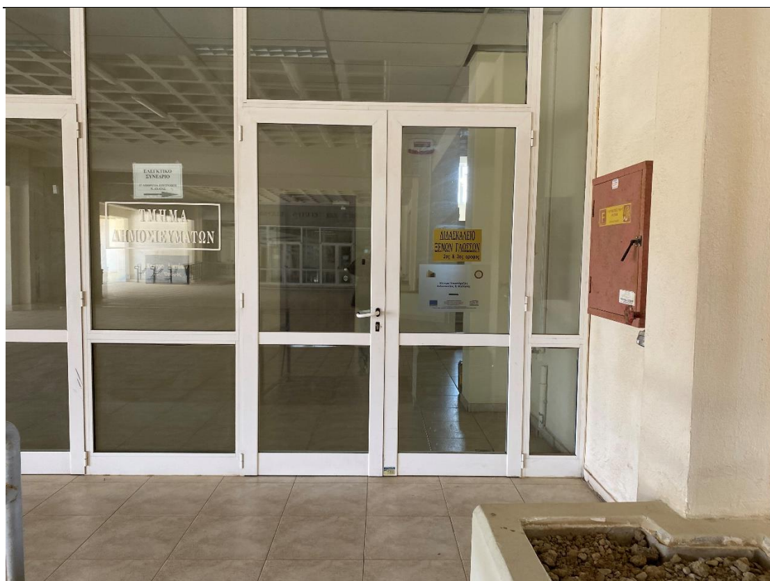
Figure 2. Entrance of the building where CTL is located

After you have entered the building, you will see on your right the door with the relevant marking that leads to the small corridor to the CTL, as shown in the picture below.