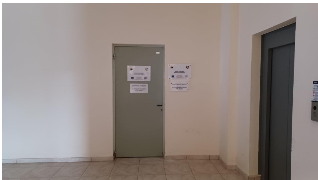
Figure 3. CTL Entrance

After you have entered the building, you will see on your right the door with the relevant marking that leads to the small corridor to the CTL, as shown in the picture below.