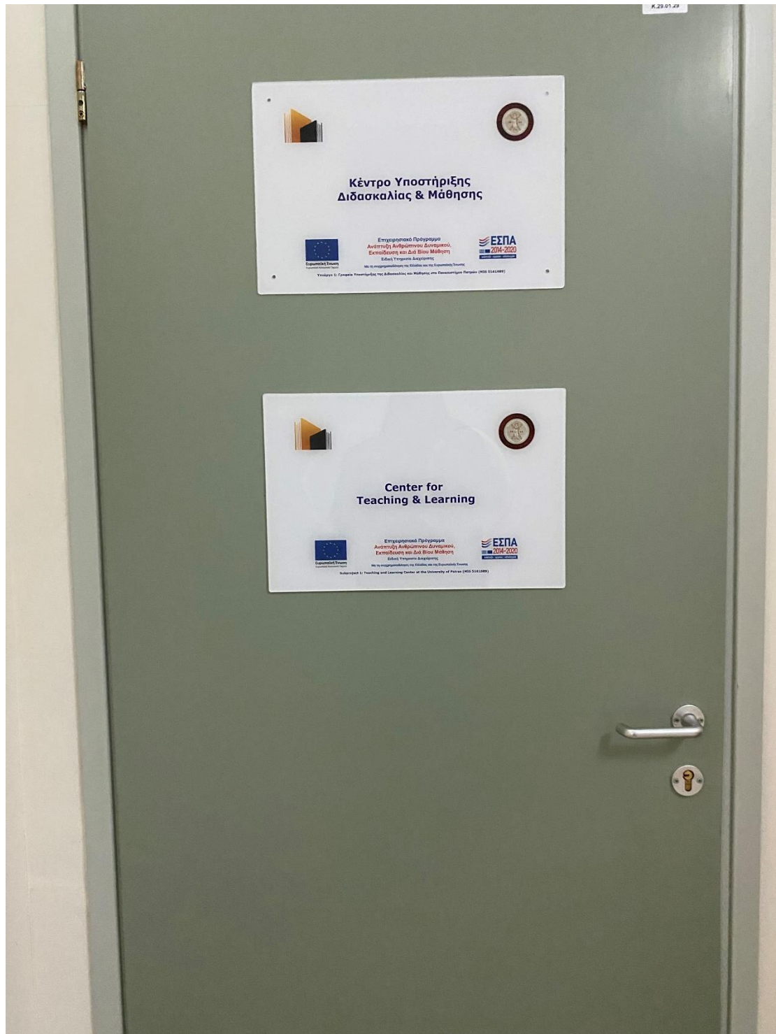
Figure 4. CTL Entrance

CTL is located to the left of the small corridor, as shown in the image below.