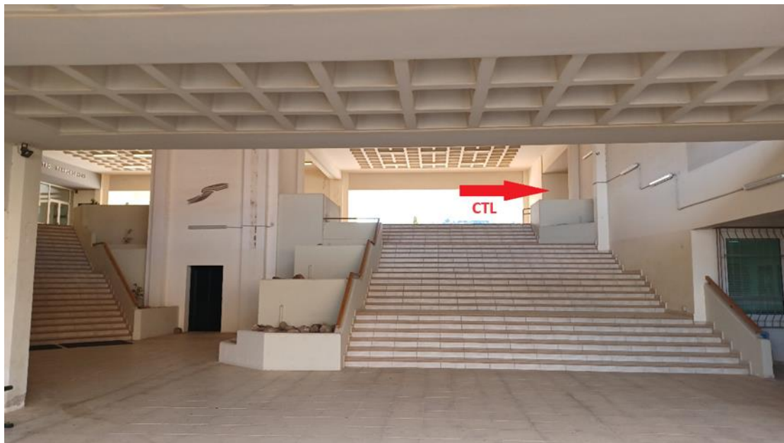
Figure 1. Main entrance of library and information centre building

Go up the stairs of the main entrance of the building shown in the picture below.